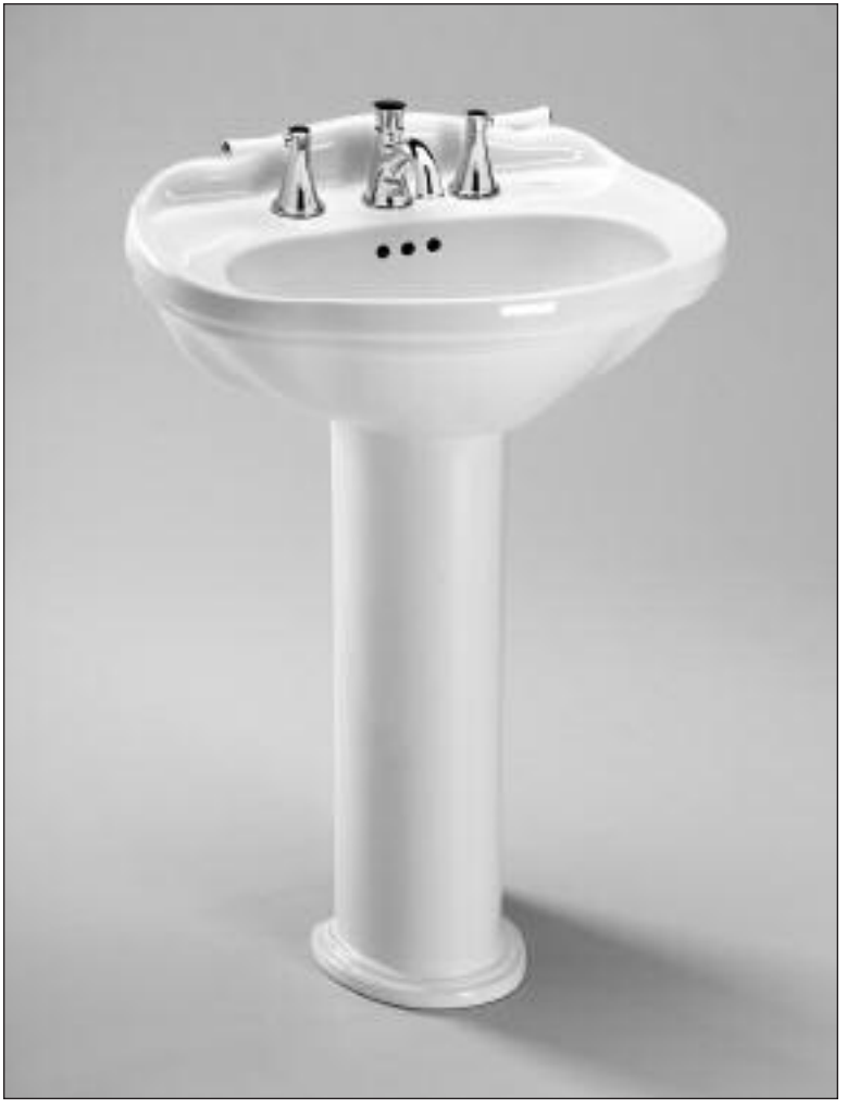
LPT754.8 - Whitney™ Pedestal Lavatory