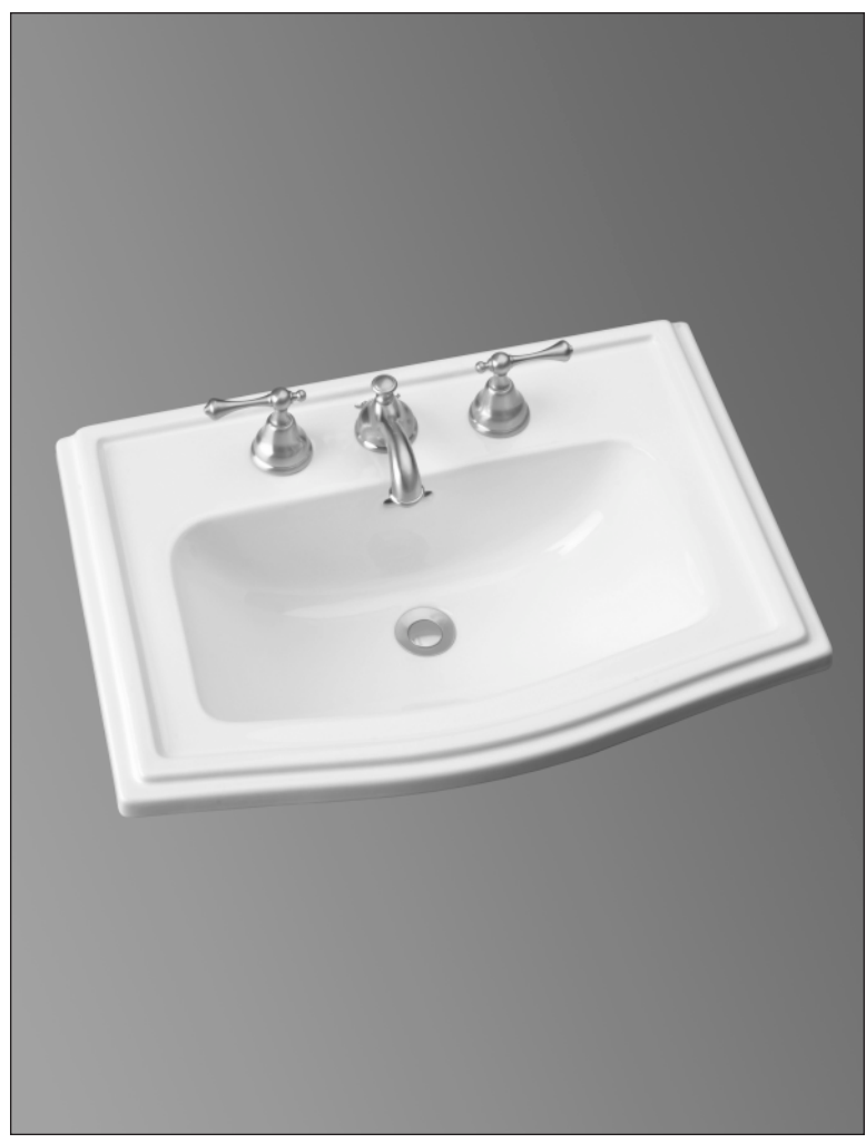
LT781.8 - Clayton™ Self-Rimming Lavatory