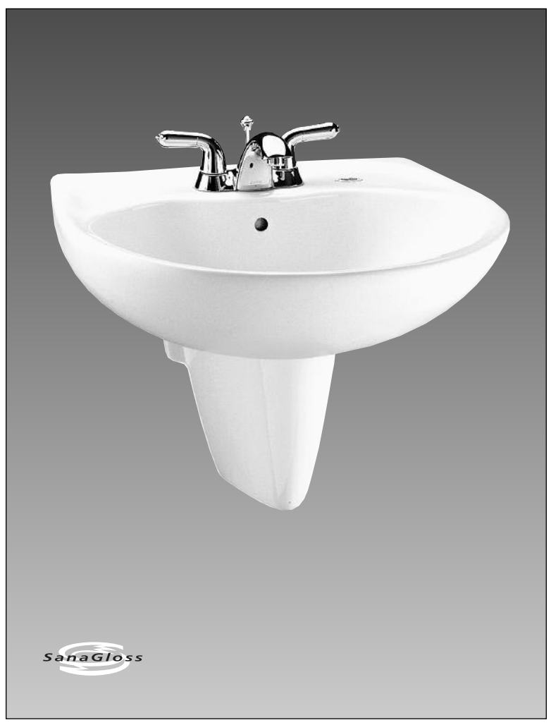
LHT242.4G - Prominence® Wall Mount Lavatory