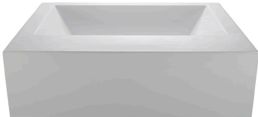
Available as a freestanding model or finished on 1, 2 or 3 sides for various installation applications.