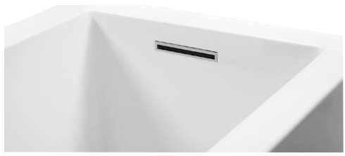
Optional Slim-Line overflow