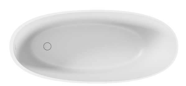
Inside view of tub

Custom sizes also available. Contact MTI for details and pricing.