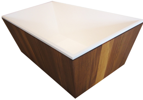
Features an integrated overflow and Teak Wrap.