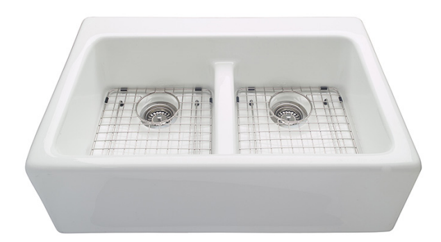
Optional sink grids shown above.