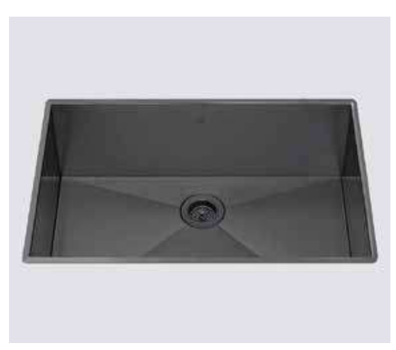
*Flush-Mount Installation Kit is included with each sink *Custom ADA compliant versions are available