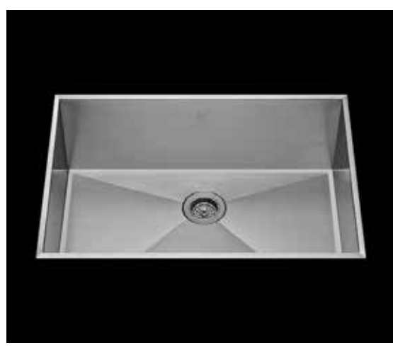
*Flush-Mount Installation Kit is included with each sink *Custom ADA compliant versions are available